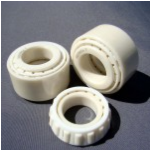
?Double-row cylindrical roller bearing