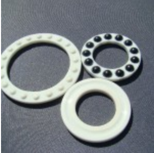
?Thrust ball/thrust roller bearing