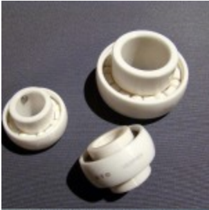
? UC spherical surface ball bearing