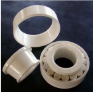
? Single-row cylindrical tapered roller bearing